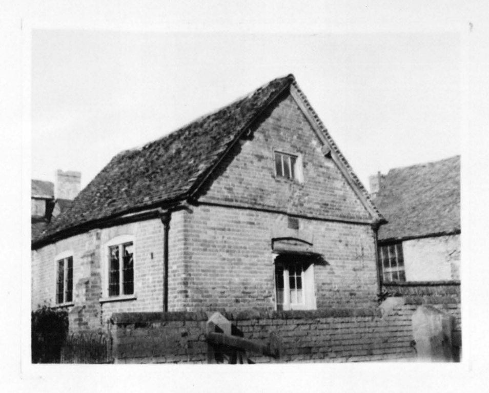
"KEACH'S MEETING HOUSE" Winslow, Bucks