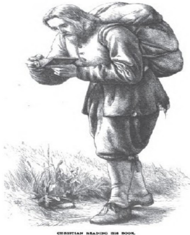
CHRISTIAN READING HIS BOOK.

drive away his distemper by harsh and surly carriages to him. Sometimes they would deride, sometimes they would chide, and sometimes they would quite neglect him. Wherefore he began to retire himself to his chamber to pray for, and pity them, and also to condole his own misery. He would also walk solitarily in the fields, sometimes reading, and sometimes praying; and thus for some days he spent his time. [5]