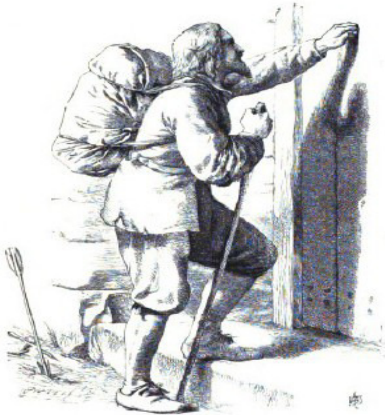
CHRISTIAN KNOCKING AT THE GATE.

treading on forbidden ground, and could by no means think himself safe, till again he was got into the way which he left, to follow Mr. Worldly-wiseman's counsel. So, in process of time, Christian got up to the gate. Now, over the gate there was written, "Knock, and it shall be opened unto you" (Matt. 7:8).