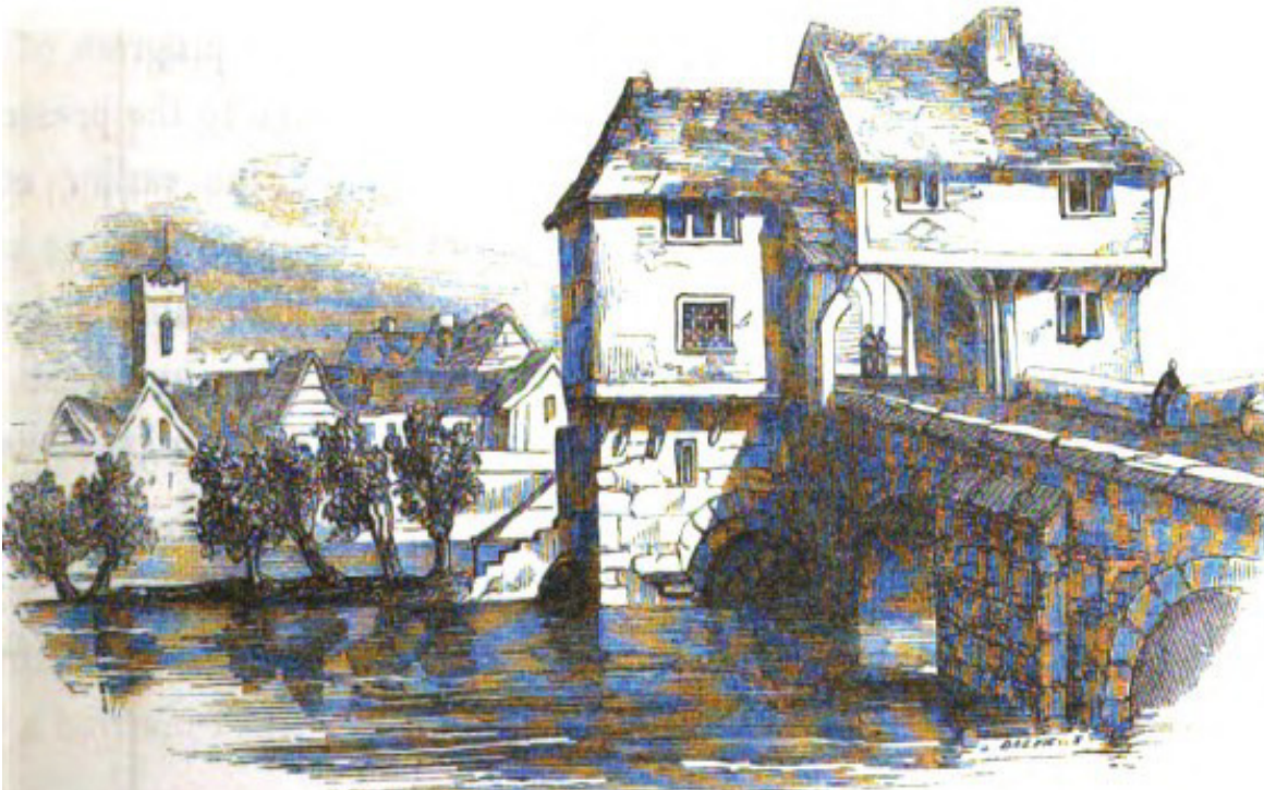
BEDFORD JAIL AND GATEHOUSE.

The extracts from Bunyan's other works, which so admirably illustrate his Pilgrim's Progress , have a reference to this new edition.